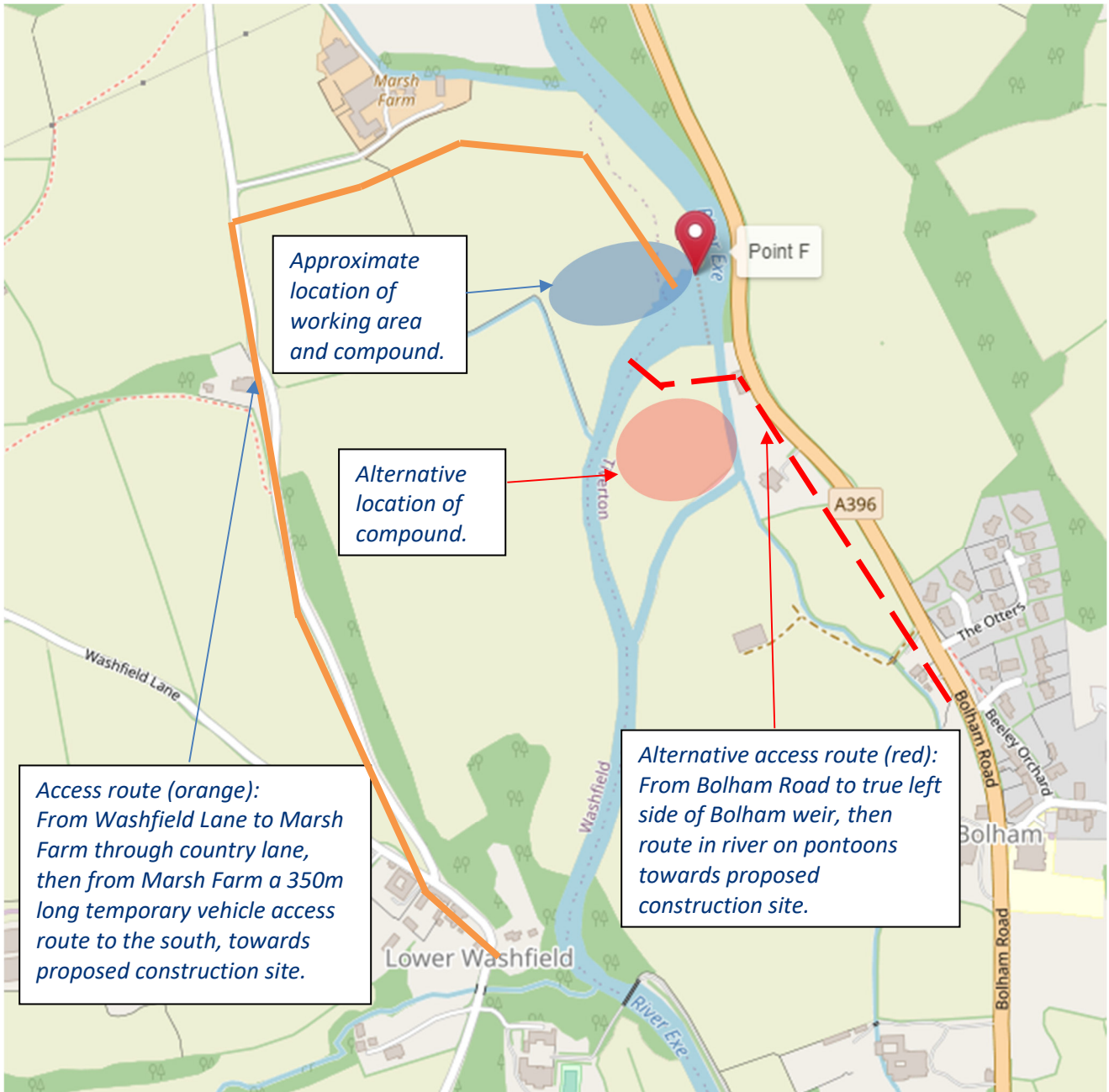
Figure 3. Access Route & Compound Location