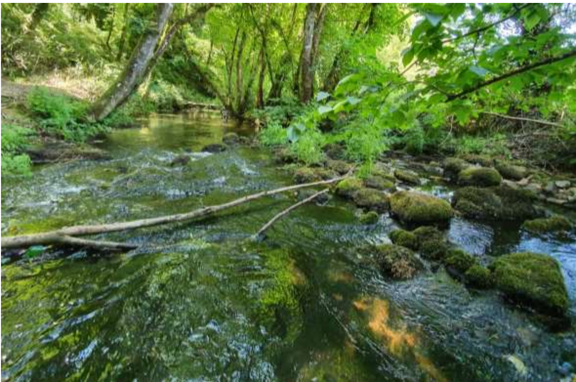
Photo 6: View of downstream habitat in low flows from central river channel