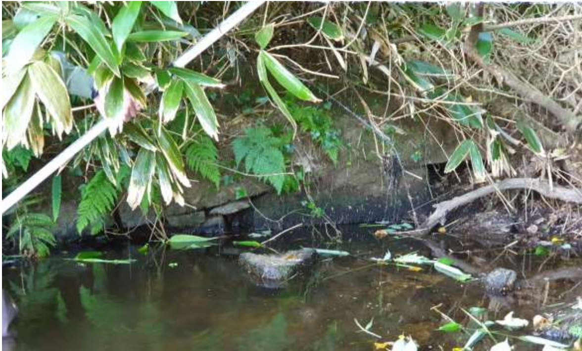
Photo 5: Approximately 15m of both the upstream and downstream banks of the structure are protected with stonework