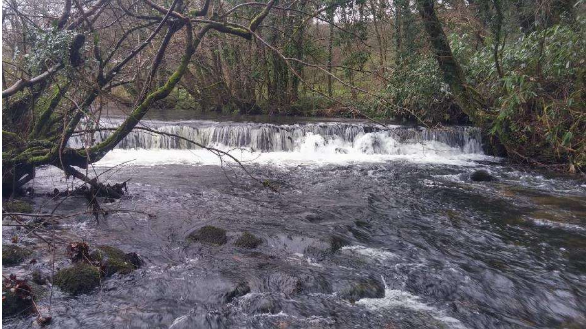
Photo 1: View of structure looking upstream from right hand bank in high flows