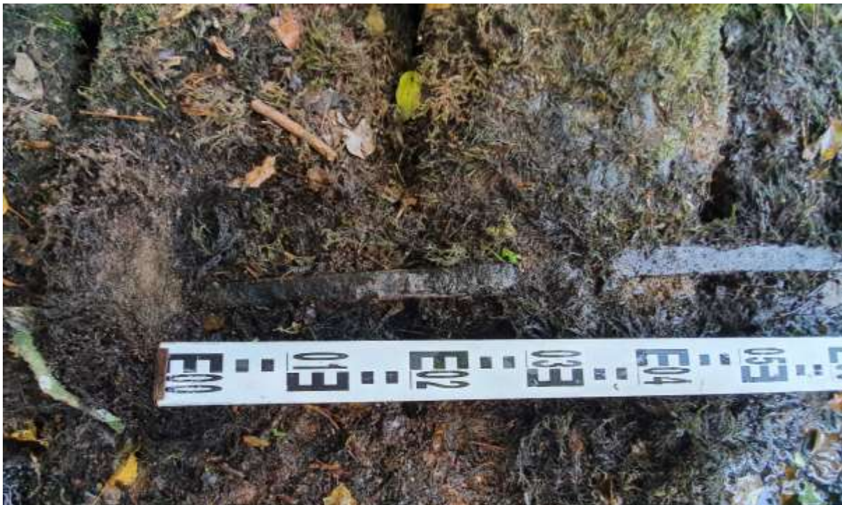
Photo 4: View of large metal staples pinned into and securing the crest boulders in position. Each staple is approximately 300mm long