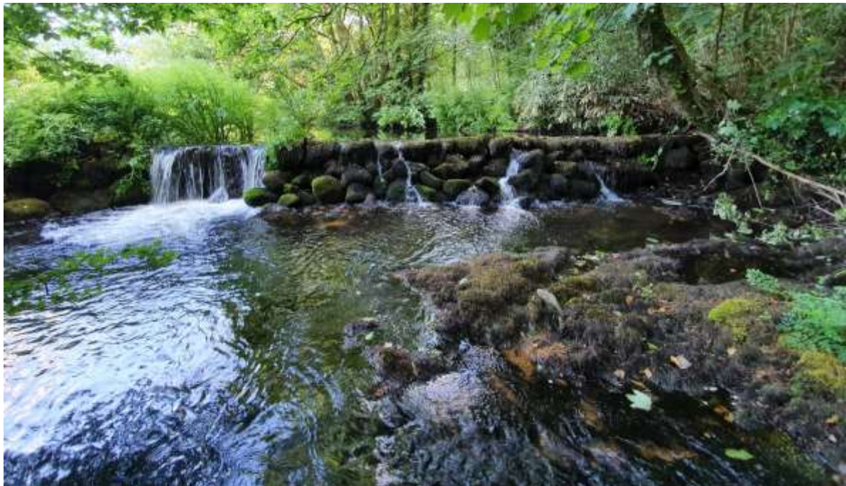
Photo 2: View of structure looking upstream from central channel in low flows