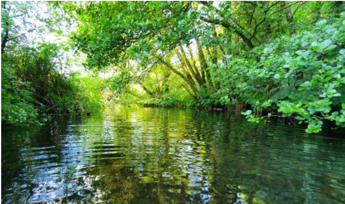
Photo 7: View of upstream habitat in low flows from central river channel