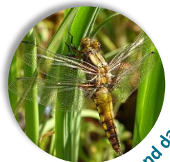
Dragonflies and damselflies

Recognise it: In general, dragonflies rest with their wings open, whereas damselflies close their wings. For ID tips see the British Dragonfly Society website.