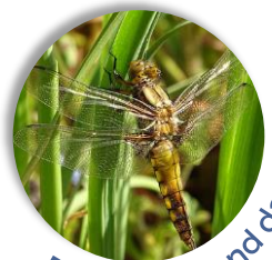
Dragonflies and damselflies

Recognise it: In general, dragonflies rest with their wings open, whereas damselflies close their wings. For ID tips see the British Dragonfly Society website.