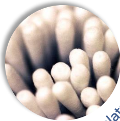
Sewage related litter

There are some types of pollution which are clearly visible, or their effects are clearly visible, but their source cannot easily be identified.