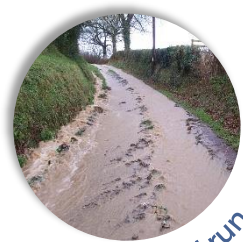
Road run off

Road surfaces are generally impermeable, allowing rainfall to flow rapidly across them. As water crosses roads, it may pick up fuels, heavy metals and other pollutants and deliver them to the river.