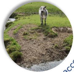
Cattle/stock access to river

When stock have direct access to the river, soil and sediment is mobilised as they trample on the river banks, and their waste can introduce microbial pollution. Hoof marks down to the river are a good indicator of stock access.