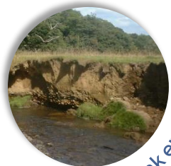
River bank erosion

As well as from the land surface, sediment may be eroded from the river banks themselves. River bank erosion is natural, but this process can be accelerated by certain land uses and vegetation.