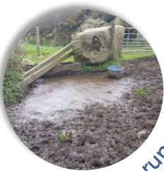
Farm run off

Pollution may enter rivers from a number of farm sources (e.g. slurry stores, yards), which often contain nutrients and chemicals. Chemicals may be toxic to wildlife, while nutrients can result in excessive algal growth. As this algae decomposes, the oxygen levels in the water are reduced, which is very harmful to fish and other wildlife.